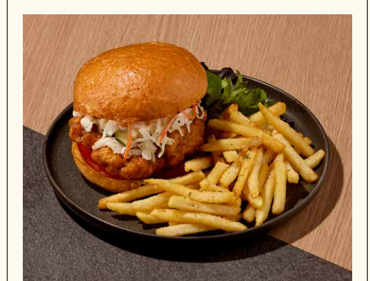
CRISPY CHICKEN BURGER Crispy Battered Fried Chicken, Roma Tomatoes, Deli Coleslaw

SERVED WITH FRENCH SOURDOUGH BUN, SHOESTRING FRIES & PETIT SALAD