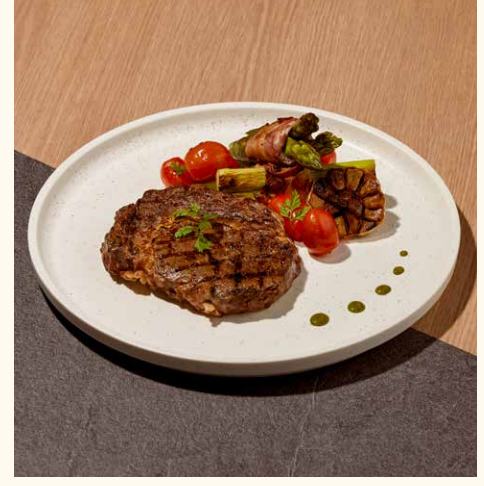
AUSTRALIAN RIBEYE STEAK * 180gm Chargrilled Ribeye Steak, Bacon Wrapped Asparagus, Roasted Tomato, Garlic Confit, Chimichurri Sauce