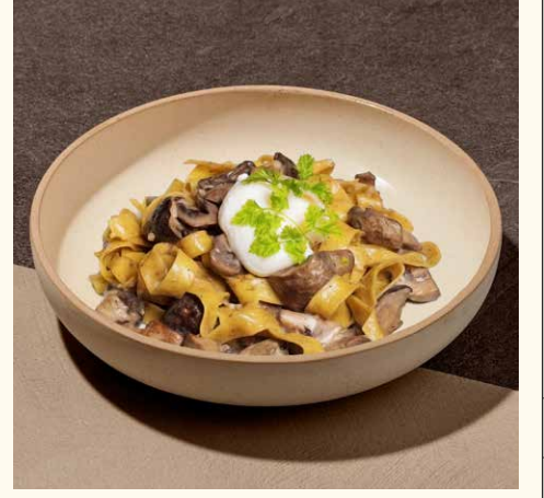
TRUFFLE CARBONARA * Fettuccine, Shiitake and White Button Mushrooms, Porcini Cream Sauce, Poached Egg, Shaved Parmigiano, Truffle Paste