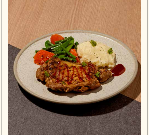
BBQ SMOKED CHICKEN 19 Pan Fried Applewood Smoked Boneless Chicken Leg, Seasonal Vegetables, House Mash, Housemade BBQ Sauce

25 130gm Grilled Australian Wagyu Steak, Romaine Lettuce, Roma Tomatoes, Cheddar, Yakiniku Sauce