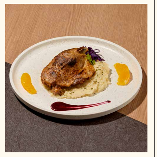
DUCK CONFIT Crispy Slow-cooked Duck Leg, Braised Red Cabbage with Apple, Orange Segments, House Mash, Blueberry Sauce