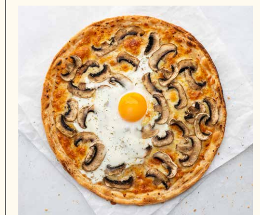
TRUFFLE SCENTED MUSHROOM & EGG * White Button Mushrooms, Runny Egg, Truffle Oil

PLEASE ORDER VIA THE QR CODE ON THE TABLE AND WE WILL SERVE YOU AT YOUR TABLE