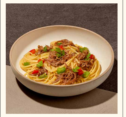
DUCK CONFIT AGLIO OLIO Spaghetti tossed with Shredded Duck. Capsicum and Basil