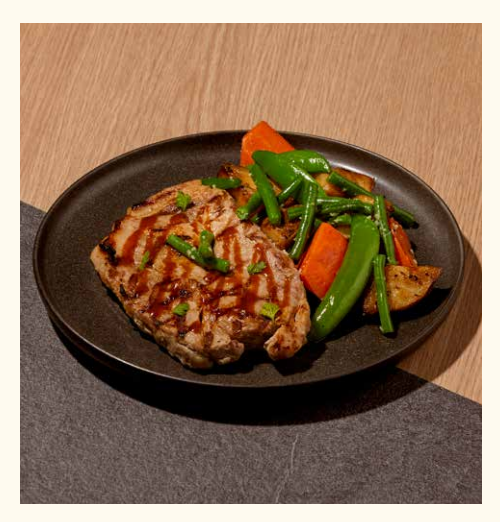
MISO PORK * Grilled Pork Collar, Roasted Potatoes, Seasonal Vegetables, Raspberry Sauce