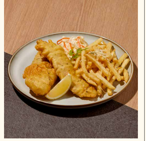
FISH & CHIPS Beer Battered Halibut, Crispy Shoestring Fries, Pear Slaw, Gribiche Sauce